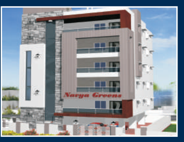
NAVYA GREEN AT SRINAGAR COLONY