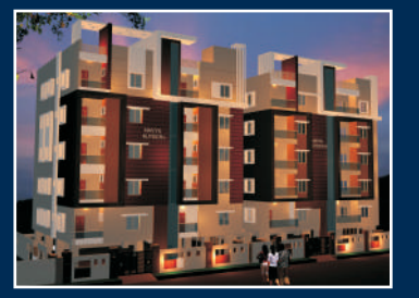
NAVYA KUTEER I &II AT KONDAPUR