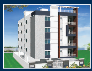
NAVYA NEST AT KONDAPUR