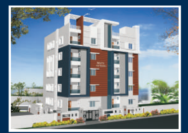
NAVYA PEARL AT SAMATHAPURI COLONY , NAGOLE.