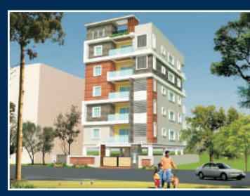
NAVYA GARDENIA AT KAMALAPURI, SRI NAGAR COLONY.